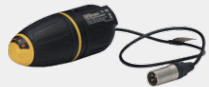
LPC Separation Filter