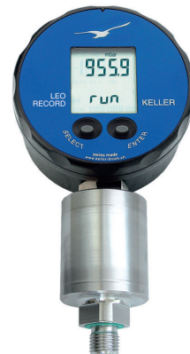
LEO Record Ei with capacitive sensor